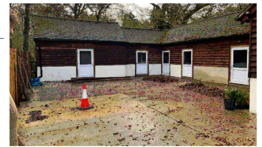
Ocas Daycare Centre-for dogs (including groomers)